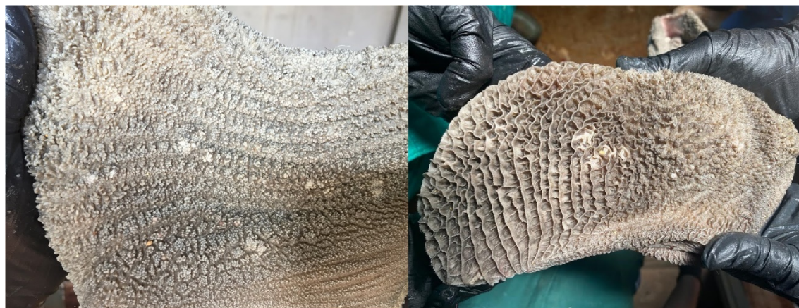
Figure 3. Occurrence of parakeratosis in calves fed concentrate containing reconstituted corn grain silage